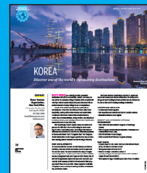
FULL PAGE ADVERTORIAL

NOTE: We reserve the right to edit your submission for size and according to the ASAE style guide.